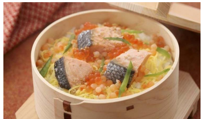
WAPPA Rice (Local mixed rice)

Looking forward to meeting you in Niigata !!