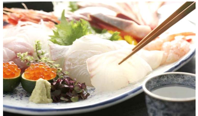
Seafood (SUSHI, SASHIMI)